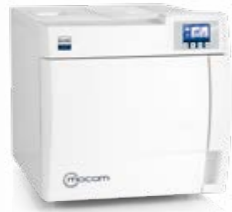
B Classic STERILIZERS