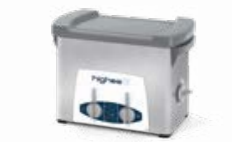
Highea 3 WASHING