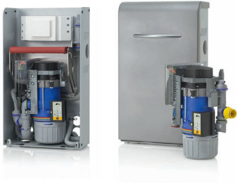
Quiet running in a housing that is ideal for dental practices

With a proven separation efficiency of around 98% and a robust design, it is quite similar to the CAS 1 Combi Separator. The integrated float monitor reliably detects the water level and regulates the CA 1 if required.