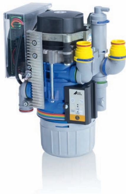
CAS 1 Combi Separator