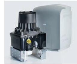
VSA 300 S – the first suction unit to incorporate both a separation system and an amalgam separator