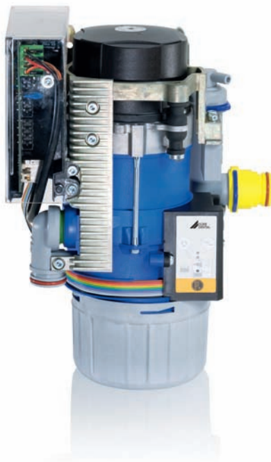
CA 1 Amalgam Separator