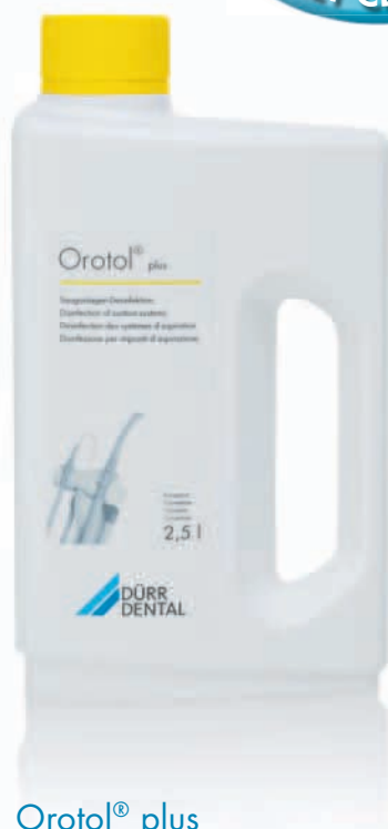
Orotol® plus Suction unit disinfection