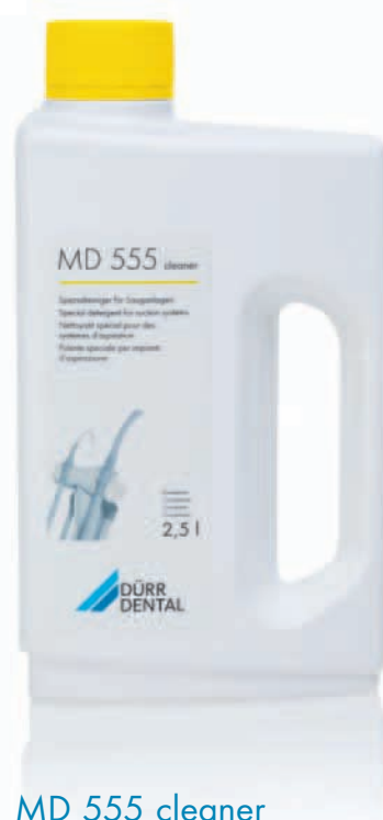
MD 555 cleaner Special cleaner

Foam-free concentrate for the disinfection, deodorization, cleaning, and care of all suction units and amalgam separators.