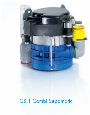
CS 1 Combi Sepamatic

tested separation efficiency of around 98%. Optionally, an additional rinsing system can be connected up to both appliances. This makes the entire system work in an even more hygienic manner, since the constant film of water prevents the deposit of particles and the coagulation of blood. Both the CS 1 Combi Sepamatic and the CAS 1 Combi Separator are compatible with a large number of treatment units and are integrated ex factory as standard by leading manufacturers.